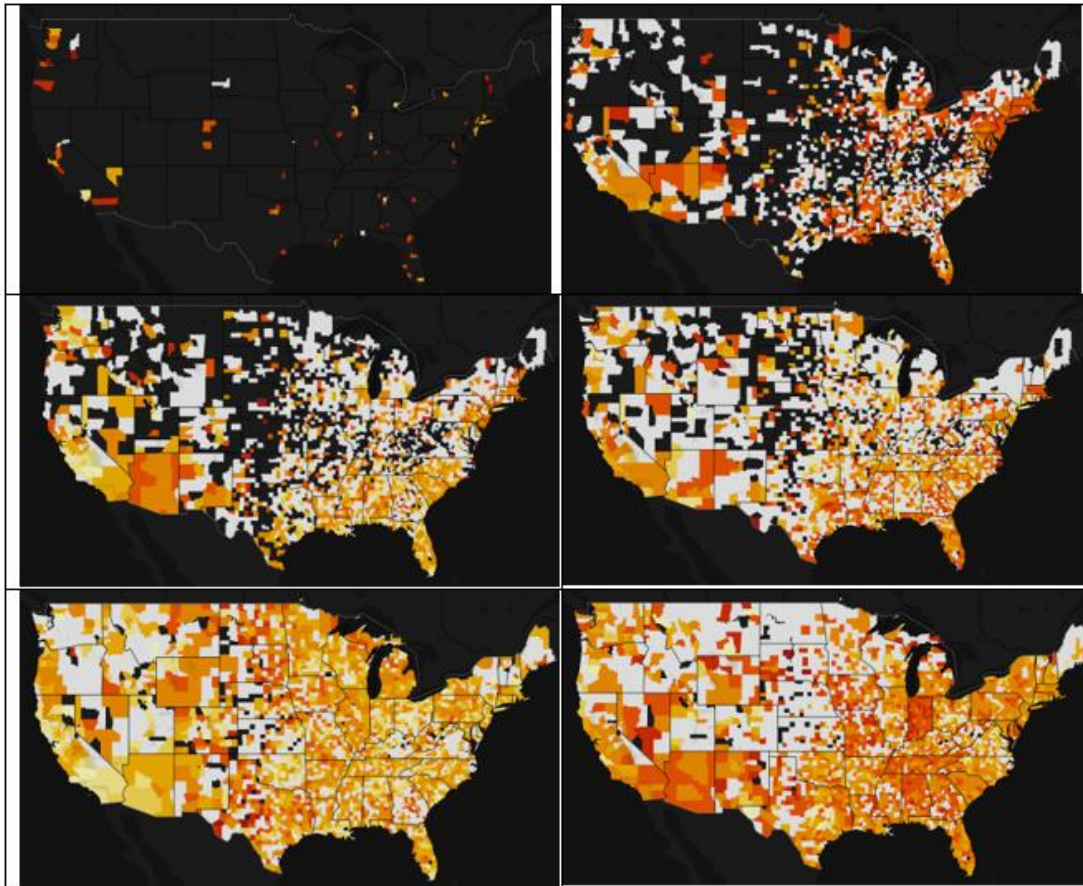
Figure 3 illustrates the case fatality rate on a county level, from the US Covid Atlas. 22 At the start of the pandemic (top left) the main epicenters had high case fatality rates, however, as the pandemic progressed, more rural areas had increased case fatality rates

At the beginning of the pandemic, the main epicenters (mostly urban) had the highest case fatality rates. However, as the pandemic progresses, more and more of the rural areas began to have higher case fatality rates. After August, many rural areas consistently had much higher case fatality rates than non-rural areas (Figure 3), despite urban areas decreasing the localized case fatality rates.