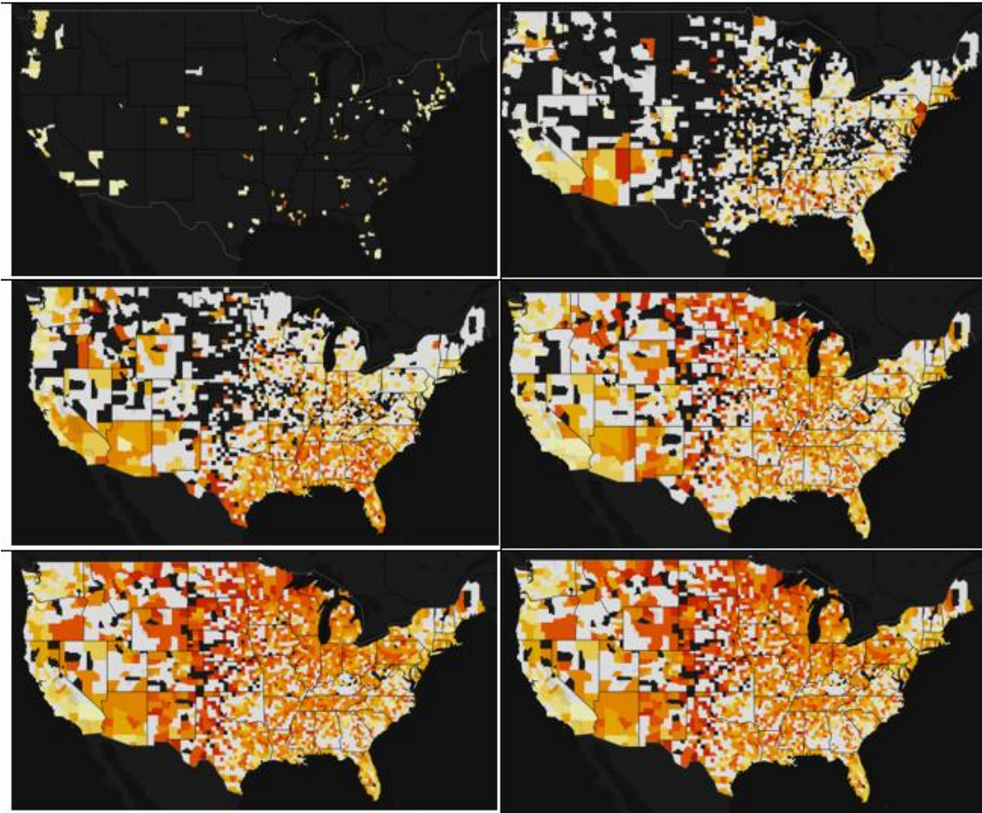
Figure 2 illustrates the death count per 100,000 population, on a county level. From the US Covid Atlas. 21 This shows the progression in severity of death counts in rural areas through the pandemic

Many of the rural areas suffered greatly once SARS-CoV-2 reached the area. This can be seen in the death counts while comparing rural and nonrural counties (figure 2). Many of the rural counties have darker and more red colors than many of the urban areas (figure 2).